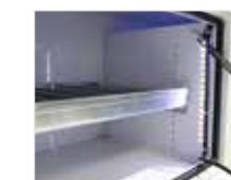
LED COMPARTMENT LIGHTS