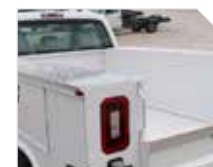
ALUMINUM TREAD PLATE TRIM KITS