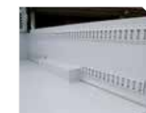
E-TRACK & ACCESSORIES