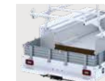
ALUMINUM DROP SIDE RACK SETS (12" AND 18")