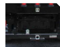
8' UNDERBODY STORAGE COMPARTMENT