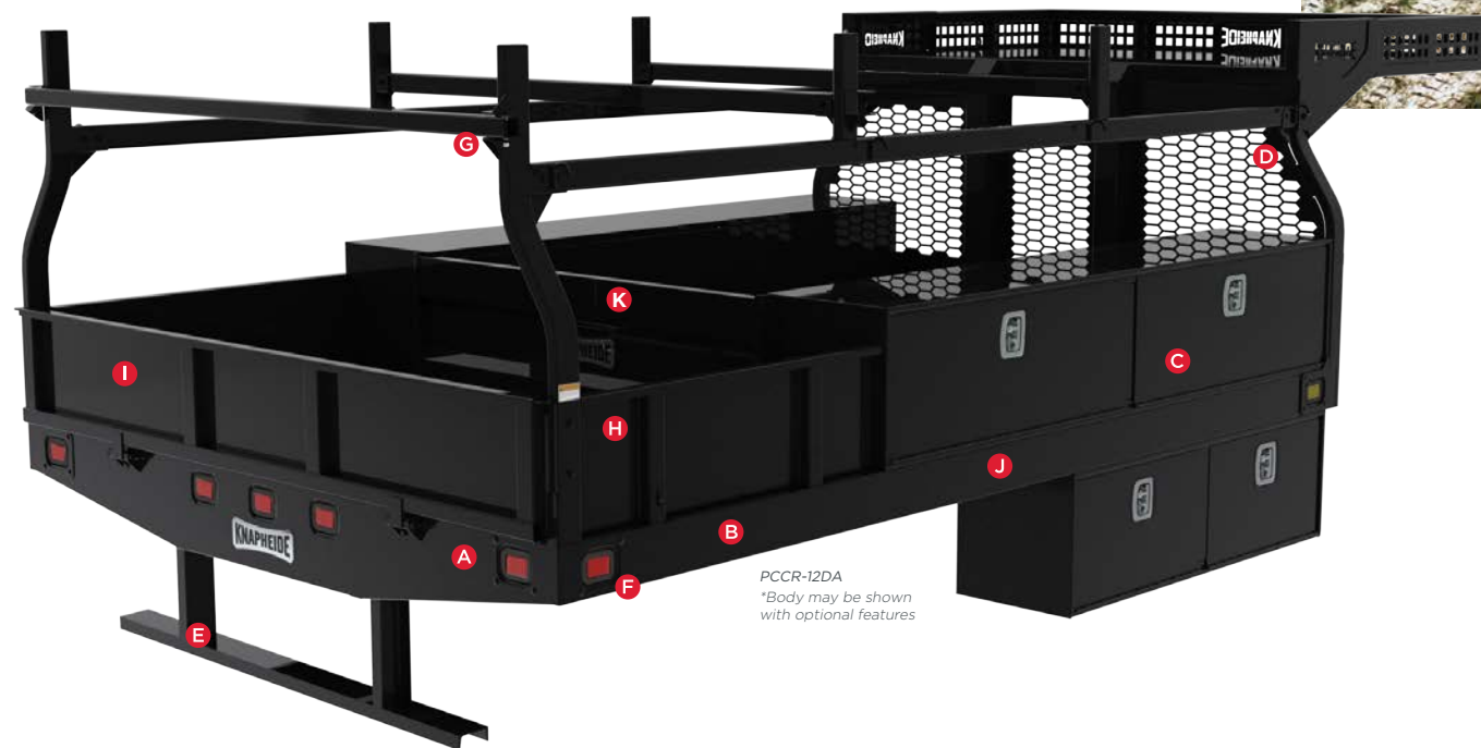
PCCR-12DA *Body may be shown with optional features

Visit knapheide.com/quote and fill out the form to receive a quote and additional product information.